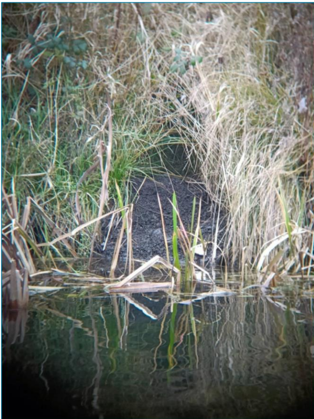
Figure 3: Otter holt along the southern bank of the Royal Canal (January 2023)