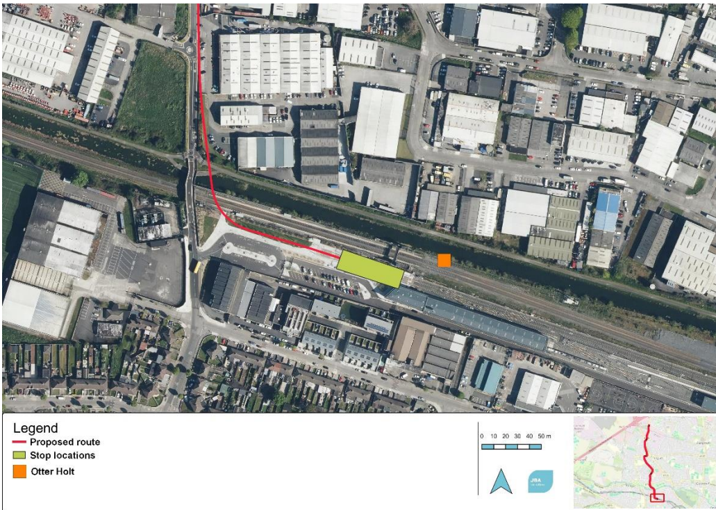
Figure 2: Location of recorded Otter holt in respect to the proposed scheme at Broombridge