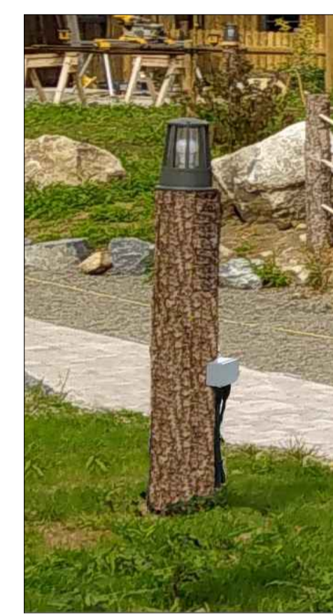
1m high Tree Bollard Footpath Lighting