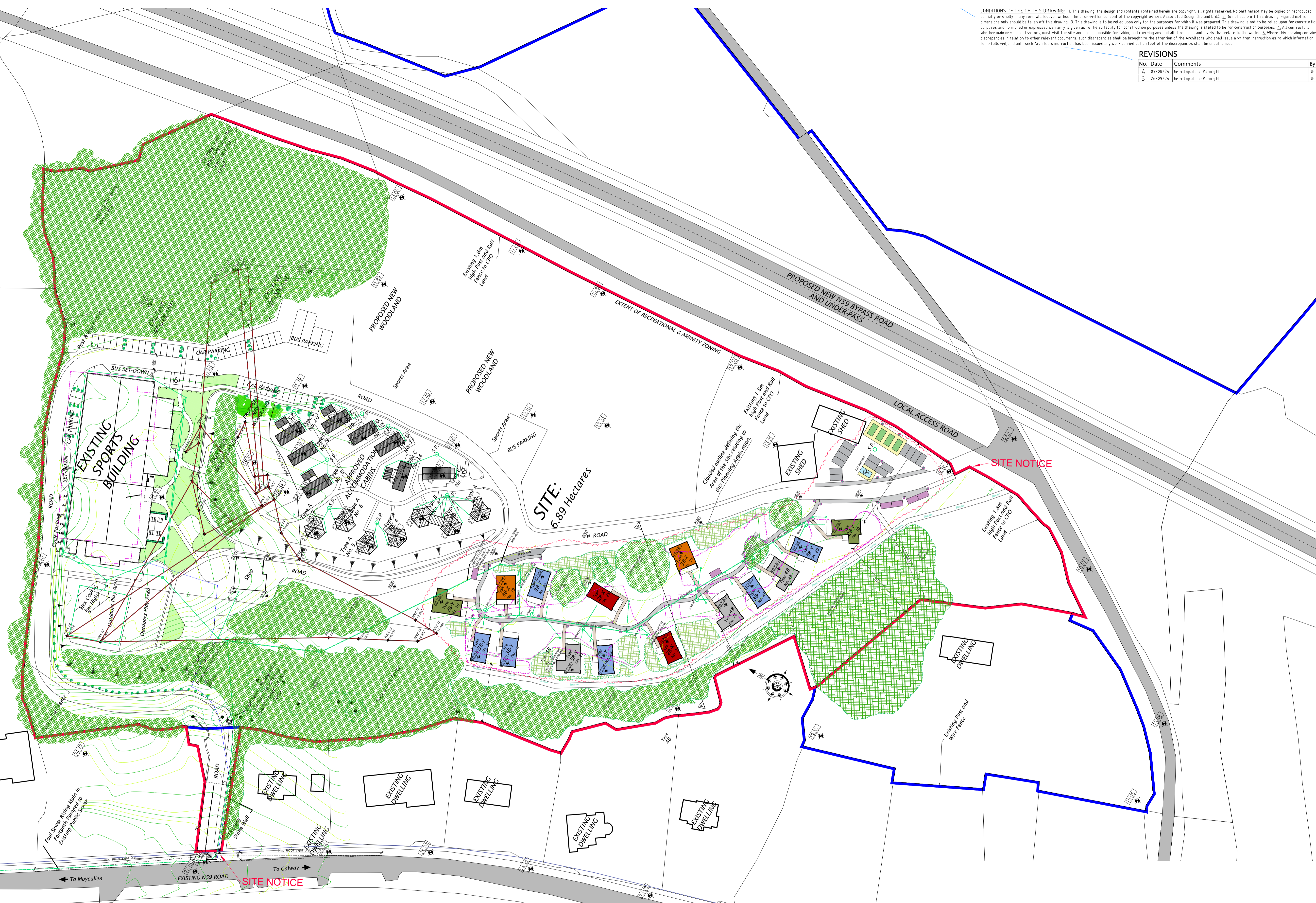
01 Site Layout Plan Scale 1:750 @ A1 Scale 1:500 @ A3