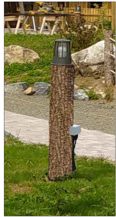
1m high Tree Bollard Footpath Lighting