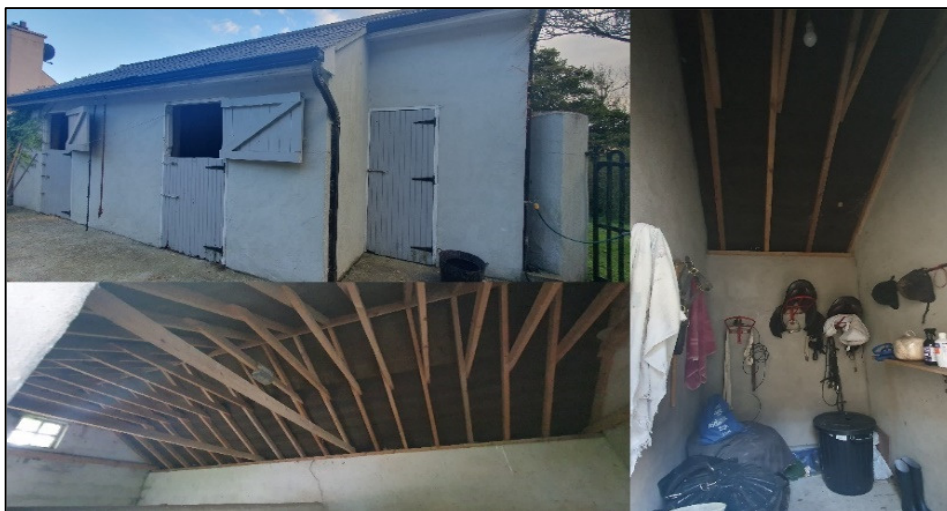
Plate 1: Stables building with tack room (top left) and internal area of tack room that likely supported a brown long-eared bat maternity roost in 2023 (right) and internal area of stables that was used for night-roosting activity by Brown Long-eared Bat in 2023 (bottom left).

In summary, the stables building likely supported a relatively large Brown Long-eared Bat maternity roost in the 2023 Summer period with daytime roosting continuing into the Autumn/early Winter period. Brown Long-eared Bat is a widespread resident bat species in Ireland, although not as frequently recorded as both Pipistrelle species (Roche et al. 2014). The conservation significance of the likely Brown Long-eared Bat maternity roost site at the tack room of the stables building in 2023 was potentially of medium to high conservation significance (see Figure 20 in Marnell et al. 2022).