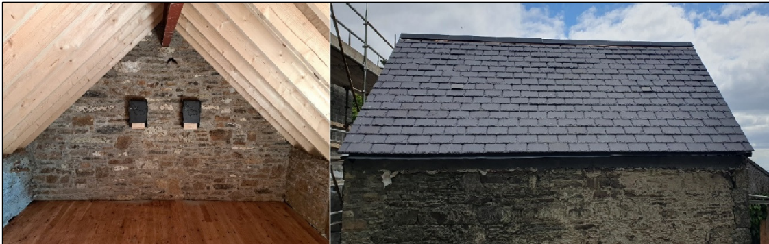
Plate 3: Internal area of dedicated bat roosting loft showing rafter roost crevice timbers & bat boxes (left) and western roof slope with 2 x bat access slates (right).

The following measures are proposed to especially improve this space for Brown Long-eared Bat.