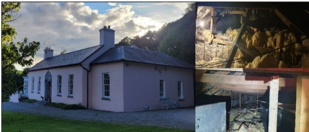
Plate 2: Sprayfield House dwelling (left) and internal attic spaces (top & bottom right).

In summary, there was no evidence of bat roosting associated with Sprayfield House in 2023 and again in 2024.