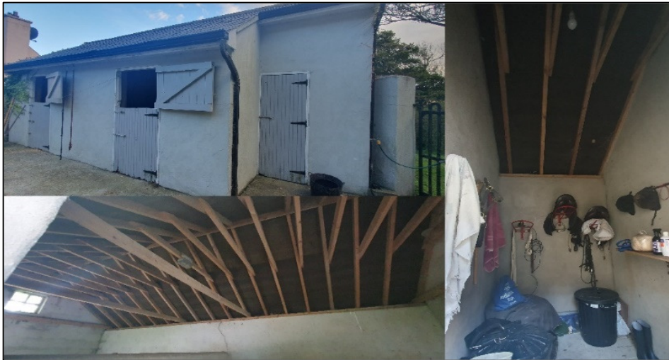
Plate 1: Stables building with tack room (top left) and internal area of tack room that likely supported a brown long-eared bat maternity roost in 2023 (right) and internal area of stables that was used for night-roosting activity by Brown Long-eared Bat in 2023 (bottom left).