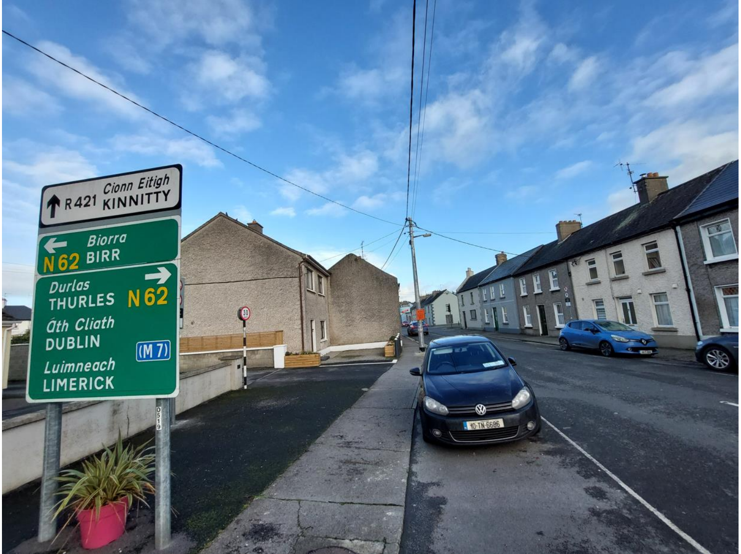
Photos 2: Side view (development is at a main junction along the N62. New build to be separated from neighbouring house, to be offset further back from the public footpath which will provide a safety buffer between the public road and footpath and better visibility at the traffic junction). New building will be further away from existing overhead ESB cables).