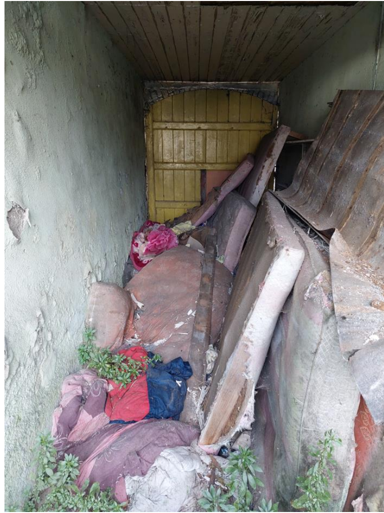
Photo's 4: Parts of this building has been used by squatters, rough sleepers and is an area known for anti-social behaviour, drug and drink taking.