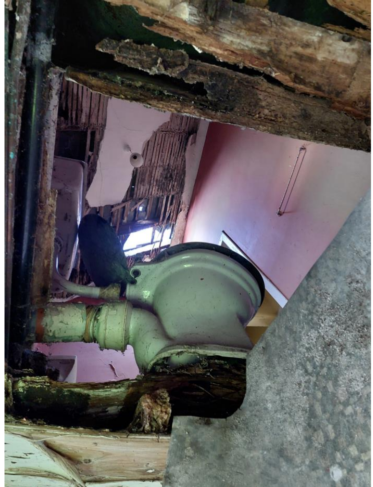
Photo's 6: View looking from ground floor up to first floor and roof (first floor joists and floors have rotten through and collapsed, roof structure rotting and collapsing in places. Not possible to safely access the first floor).