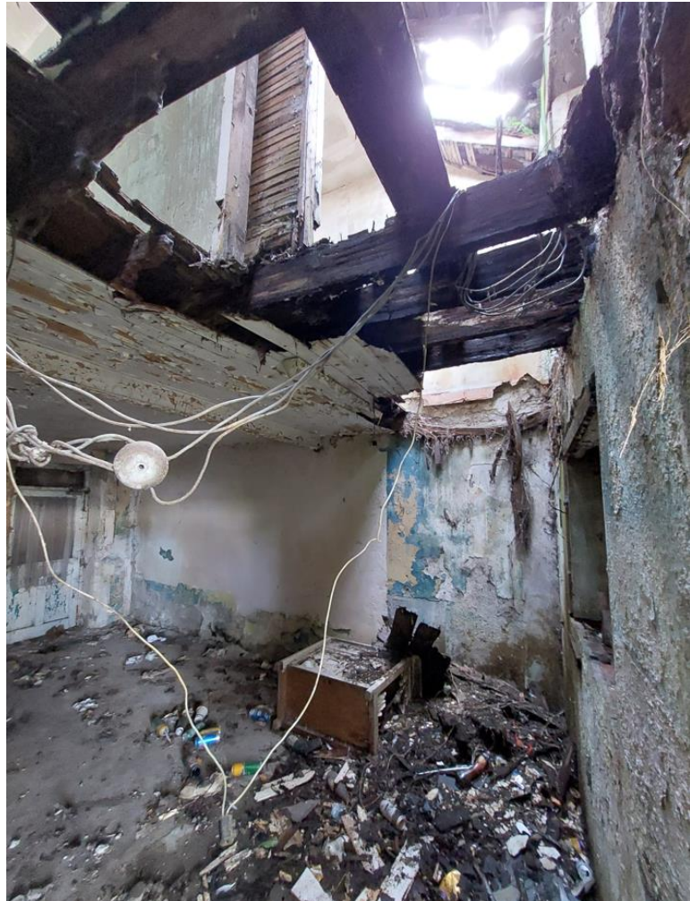
Photo 10: View from Ground floor looking up (first floor joists rotting and collapsed, roof structure rotting and collapsed in places. Not safe to access first floor. Area used for anti-social activity).