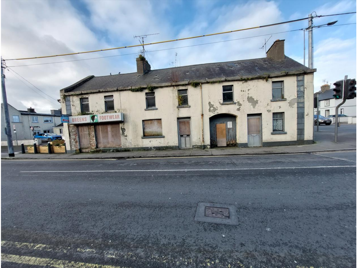
Photo 1: Front view (public footpath directly underneath, roof sagging, roof tiles slipping, vegetation growing within soffit, gutters removed previously for safety)

“(c) In the interests of public health and public safety, or for other imperative reasons of overriding public interest including those of a social or economic nature and beneficial consequences of primary importance for the environment”