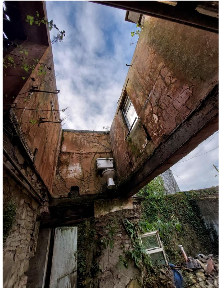
Photo 9: View of rear rooms (roof and first floor joists previously collapsed and removed).