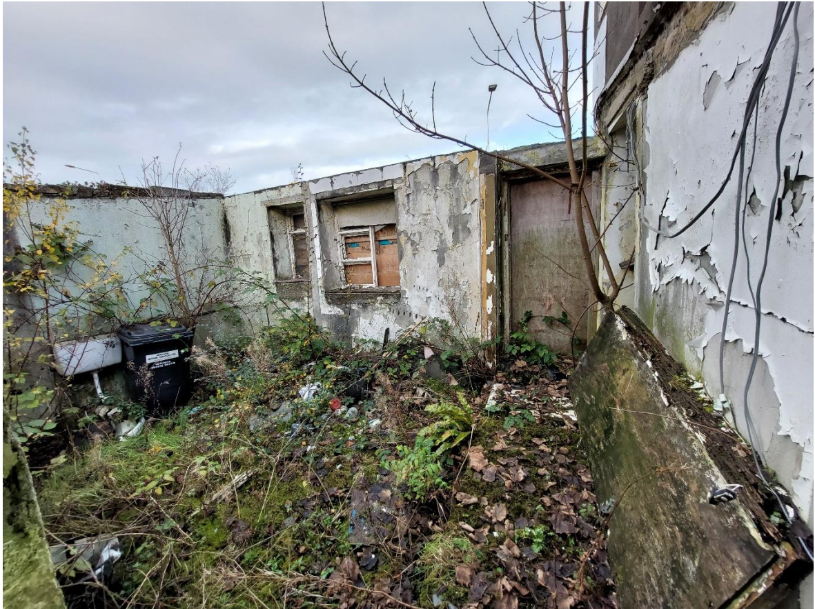
Photo 6: View of rear room (vegetation taken over, roof collapsed, rubbish thrown into area)