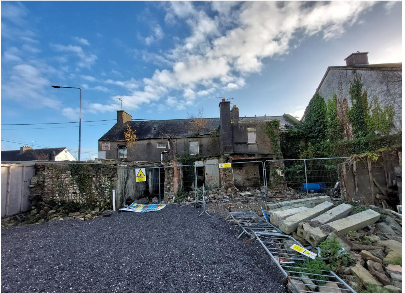
Photo 3: Rear view (roof is sagging, rotting and will eventually collapse. Roof tiles currently slipping off roof. This structure is joined with an inhabited private house which will be affected the more this building deteriorates over time).