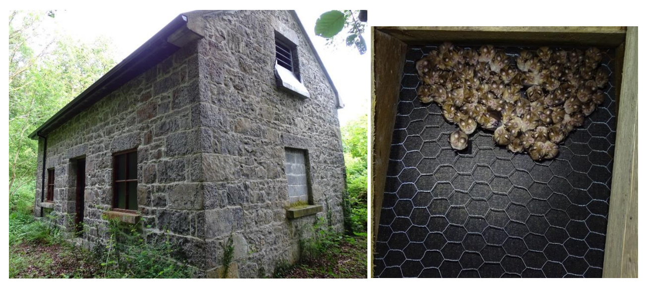
Plate 1a,b: Garryland Lodge (external view) and Lesser horseshoe bats in roof space (internal).