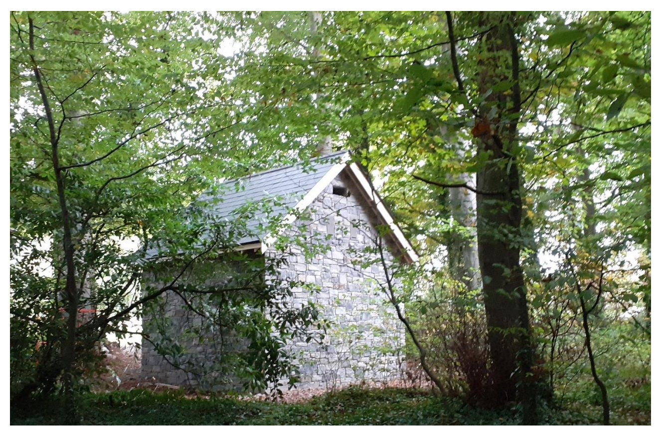
Plate 2: Bective Bat House (external view) inside deciduous woodland.

Target bat species: Whiskered bat, brown long-eared bat