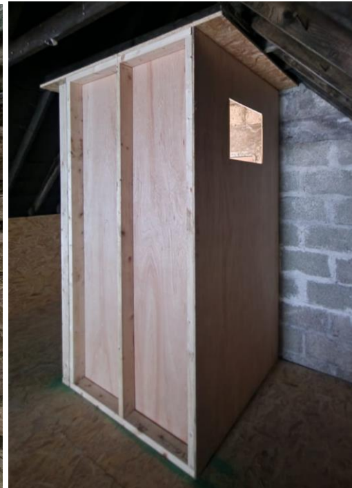
Plate 3a-d: Main Bat House (external view of new roof), single lesser horseshoe bat recorded in roof space prior to renovation, new loft access point(predator proof) with internal baffle partition.