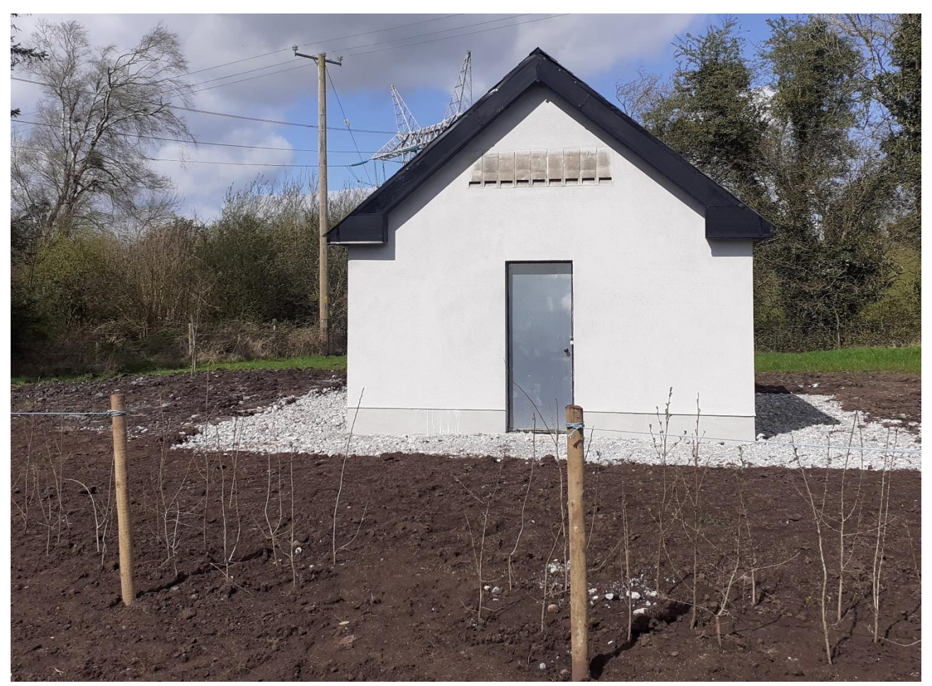
Plate 3: Oldstreet Bat House (external front view with 1FR bat tubes) with boundary hedge planting.