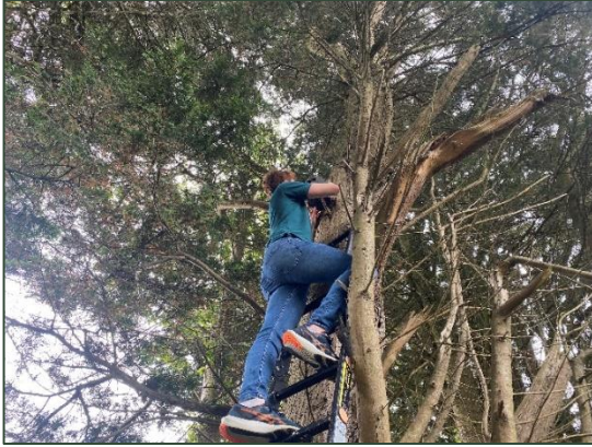
Plate 1 – Installing bat box on Leylandii Cypress treeline in July 2022.