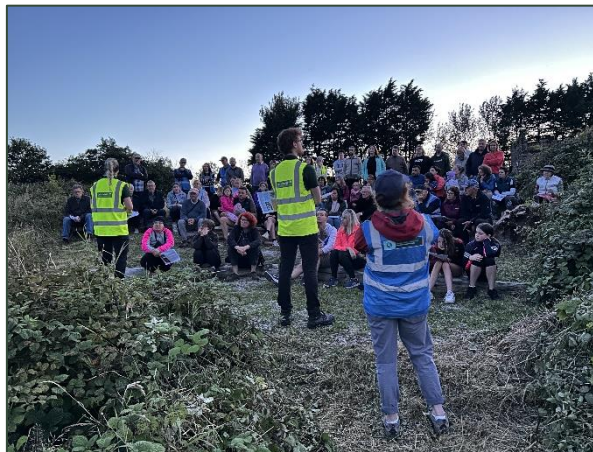
Plate 3 – O'Donnell Environmental conducting 'bat walk' for Cork County Council within Harper's Island Wetlands.

Prior to the commencement of tree-felling works, O'Donnell Environmental will undertake a bat box check to confirm that no roosting bats are present. Should roosting bats be encountered, the bat box entrance will be appropriately sealed temporarily and carefully removed from the tree, before being relocated to a nearby undisturbed location. Following a period of approximately 15 minutes, the bat box entrance will be re-opened to facilitate access/egress of bats should they be present. Proposed tree felling and movement of the bat box will avoid periods of cold weather where bats may be in torpor.