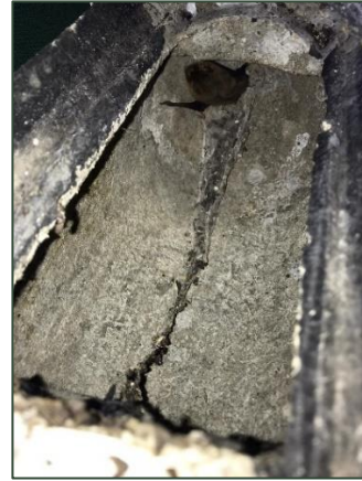
Plate 2 – Single male Common Pipistrelle within bat box in August 2023.