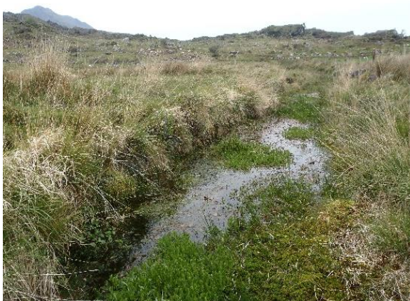
Blocked 122 drains