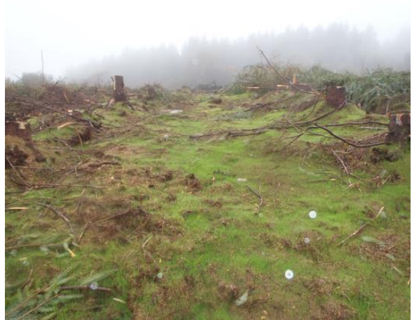
Trialled novel mitigation measures e.g. grass over-sowing with Holcus lanatus and Agrostris capillaris