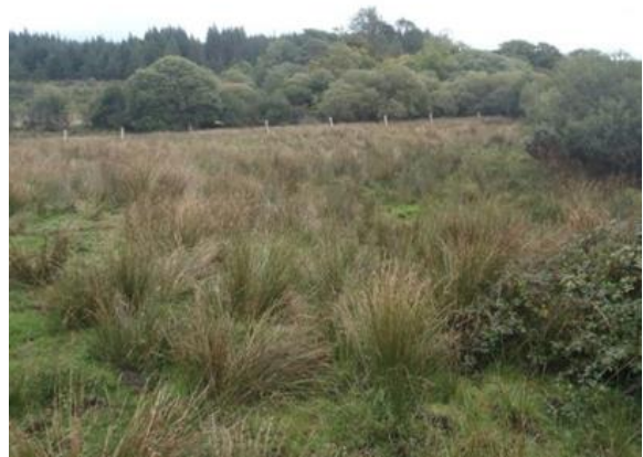
Reduced sediment losses by improving the condition of 427 ha of critical source area