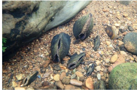
Collected and collated extensive baseline information on the condition of the freshwater pearl mussel populations and associated habitats.