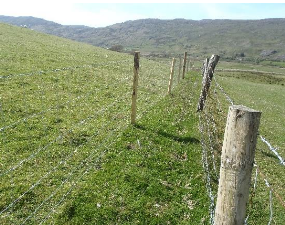
Planted 2.6 km of hedgerow