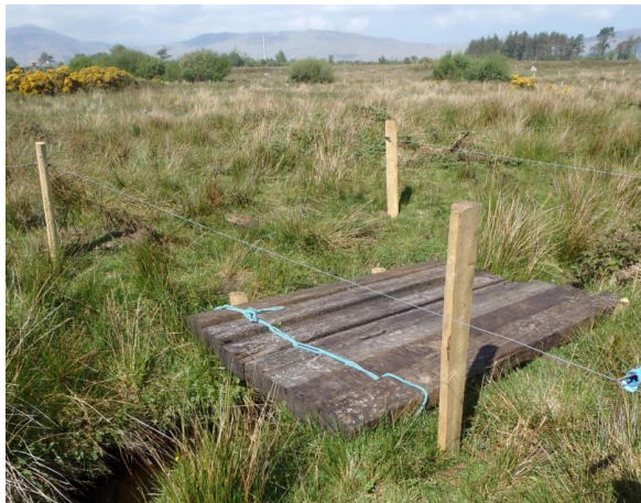
Enhanced livestock management facilities