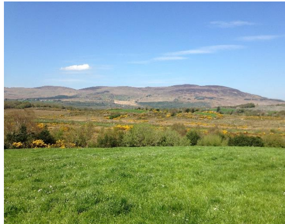
Reduced nutrient inputs on farms across 501 ha