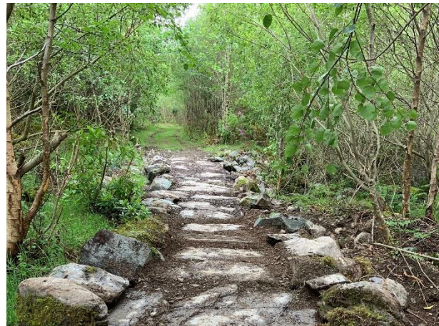
Created 7.6 km of looped walkways