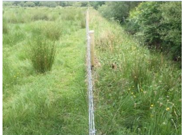
Re-vegetated 76 km of drains