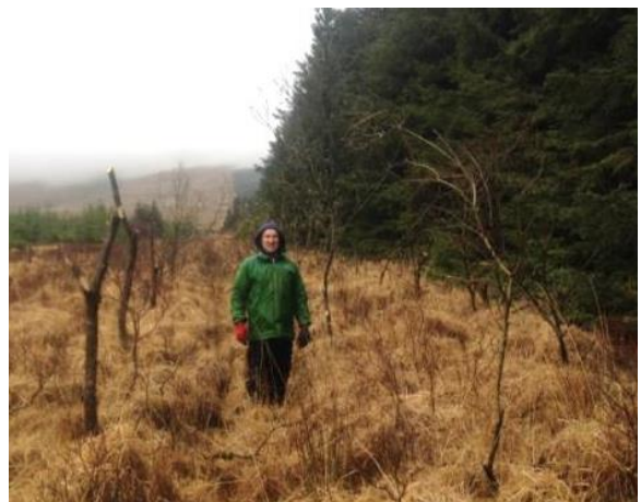
Trialled novel firebreak methods e.g. birch planting, grazed firebreak and controlled burning.