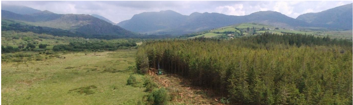
Surveyed 542 ha of forestry