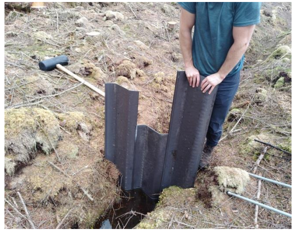
Blocked 122 drains