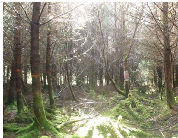
Restructured 178 ha of conifer plantation to long-term retention woodland or open peatland habitat