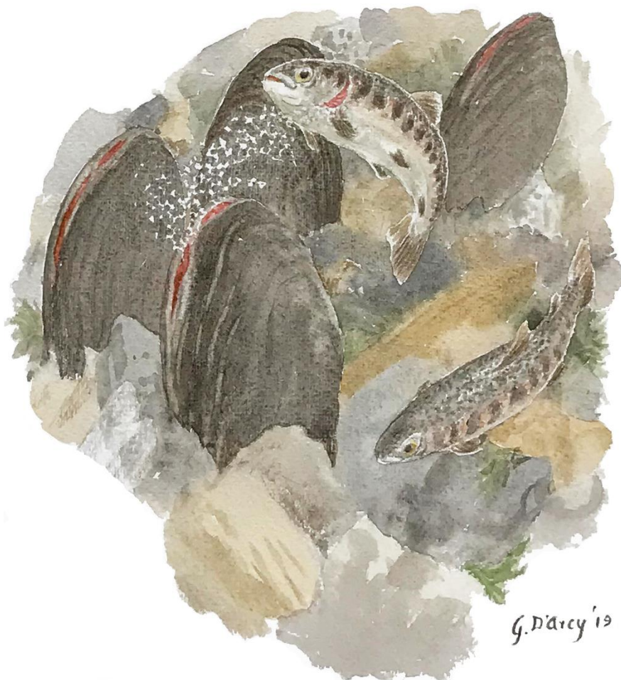
Fig. 1 Freshwater pearl mussel and host salmonid fish

The freshwater pearl mussel ( Margaritifera margaritifera ) is one of the most critically endangered species in Europe. Individuals can grow to more than 15 cm in length, slowly building up thick calcareous shells in rivers with relatively soft water and low levels of calcium. The freshwater pearl mussel has a complex life cycle producing free-living glochidial larvae that require an intermediary fish host, typically Atlantic salmon ( Salmo salar ) and sea trout ( S. trutta ) in Ireland, to complete their life cycle. After 9 months, the larvae develop into juvenile mussels and drop off their hosts where they bury into gravel and sand substrate of the river bed, feeding, breathing and growing for the first five years. Once large enough to withstand the flows they settle part-buried in the river bed where they filter-feed and can live for over 100 years.