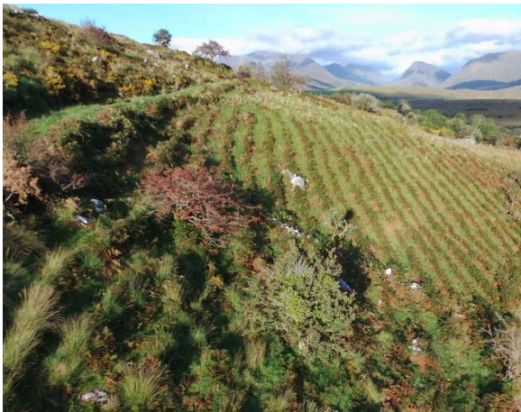
Established 27 ha of native woodland