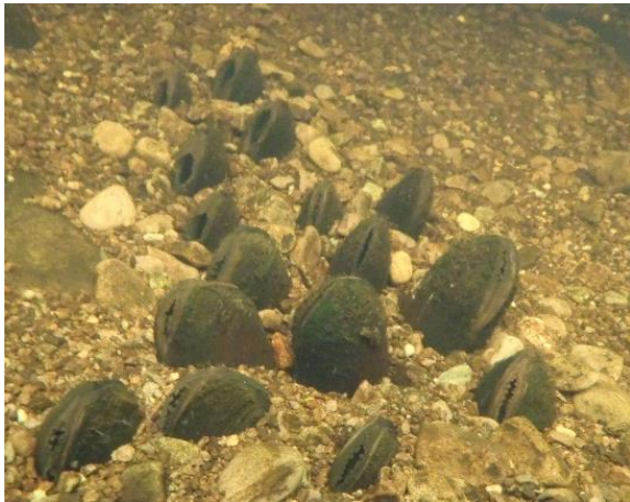
Improved freshwater pearl mussel habitat condition

The project worked closely with farmers and forest-owners within these two SACs. The original target area was 2,500 ha of farmland and 515 ha of forestry (in both public and private ownership) was exceeded with 5,038 ha of farmland and 542 ha of forest involved. By project end at 31 st August 2020, the key deliverables and outputs achieved were: