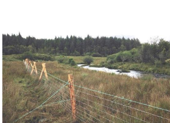
Created 5.9 km of buffers