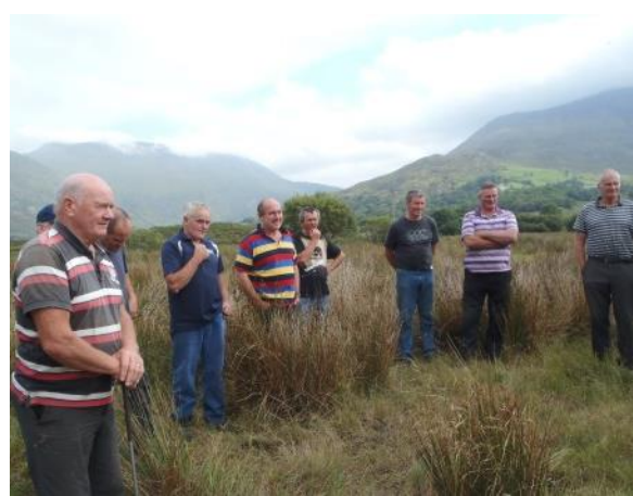
Worked with 42 participants (farmers and/or forest-owners)