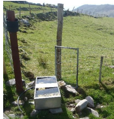
Installation of 262 alternative livestock drinking facilities