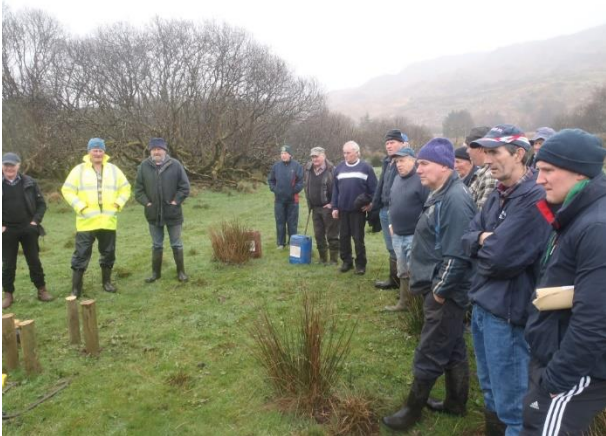
Up skilled and trained farmers and forest-owners