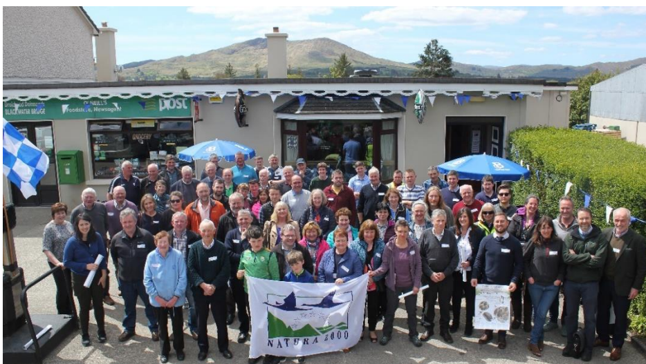
Raised awareness of freshwater pearl mussels and the importance of the SACs among farmers, forest-owners and local communities