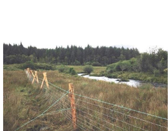
Created 5.9 km of buffers