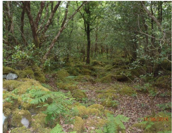
Conserved 14.1 ha of existing woodland