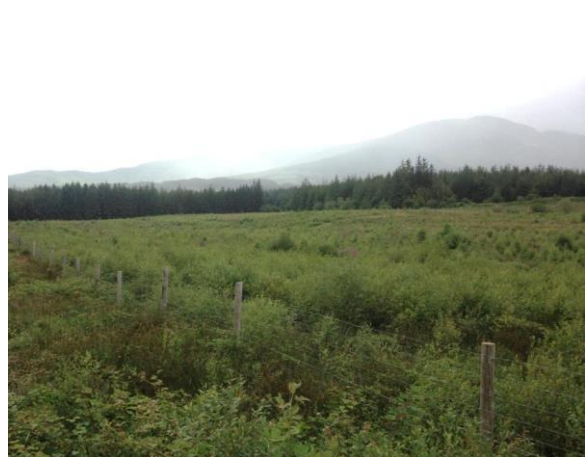
Converted 50.2 ha of conifer plantation to long-term retention native woodland